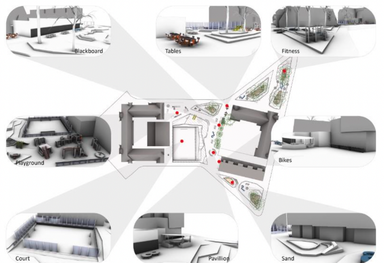
Figure 2: Triggering curiosity at Polderplein by Chrysa Mastrogiannopoulou, Vaia Pitaskou,Kadir Terzi, Tobias Jahn